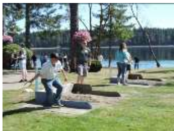
There were a number of activities for the military folks including horse shoes, basketball and very fine cigars