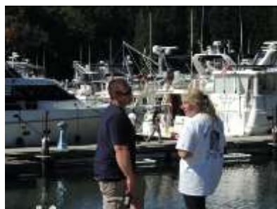
some soldiers found things that were better than beer, volleyball or salmon