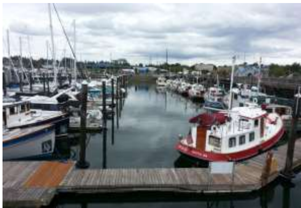
Victory Tugs at Harbor Days