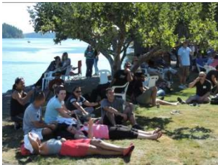
The apple trees were a popular place to catch a breeze and meet other military folks