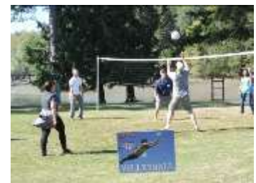
The volleyball game never stopped even for food