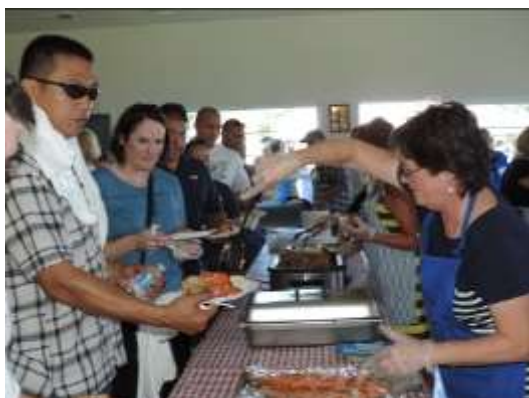
The line for food lasted for 45 minutes with two tables serving simultaneously