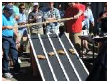
Other events included potato race cars and chipping golf balls. The golf balls went straighter