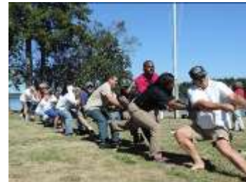
The tug of war was a run-away until OYC again anchored their line and defeated the entire Armed Services