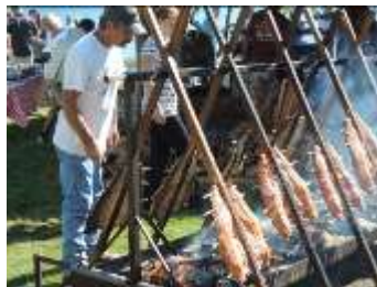
The Squaxin Tribe provided a boat load of salmon.