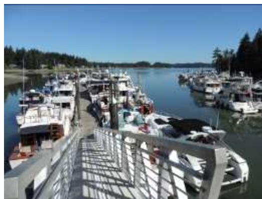
A nasty low tide saw the 43 boats churning up mud as they came in. More than one ran aground