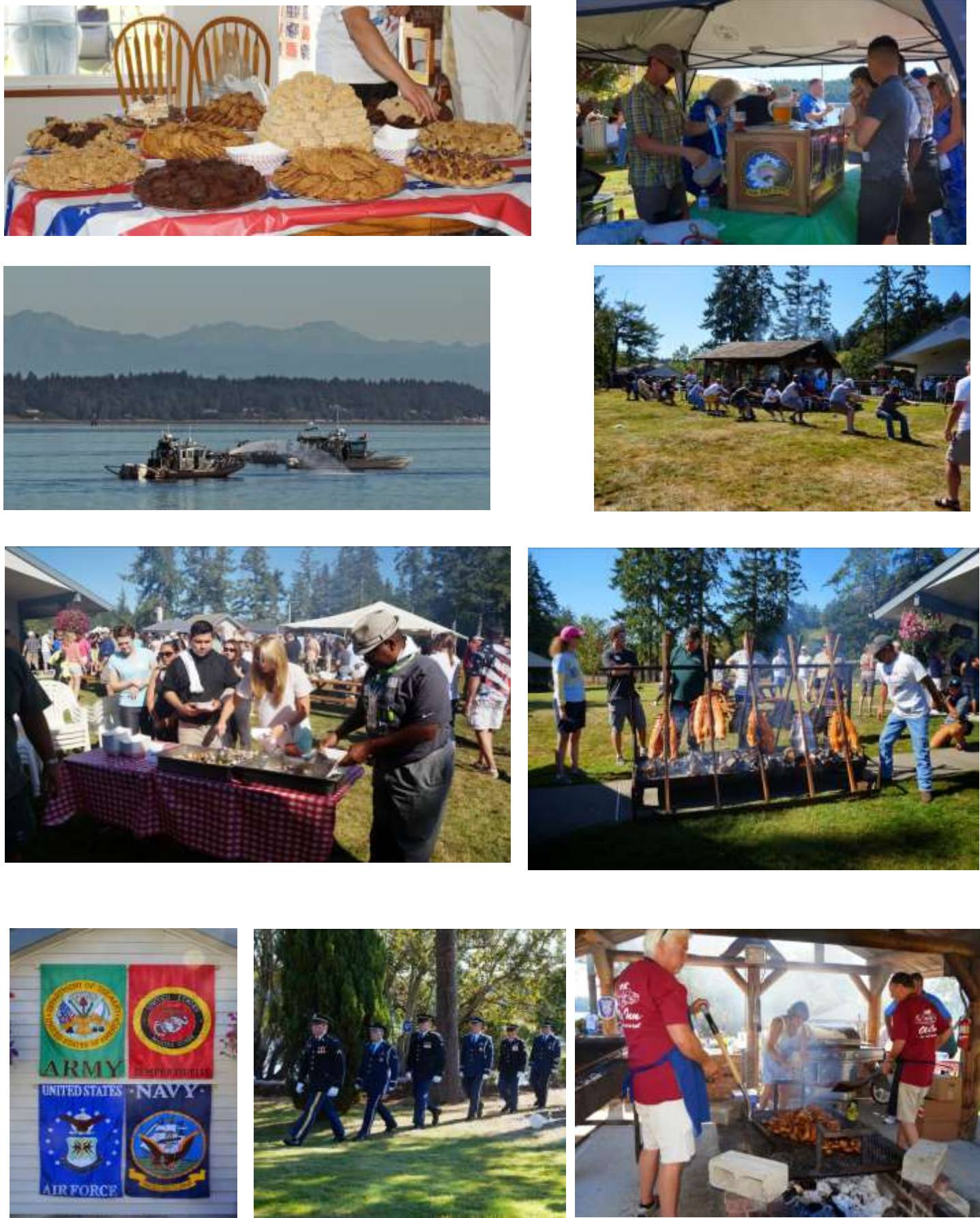
Foofaraw