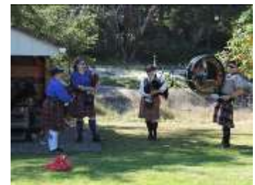
The bagpipe band serenaded the boats coming in from the point and then re-grouped by the wood shed where they drove out all the rats