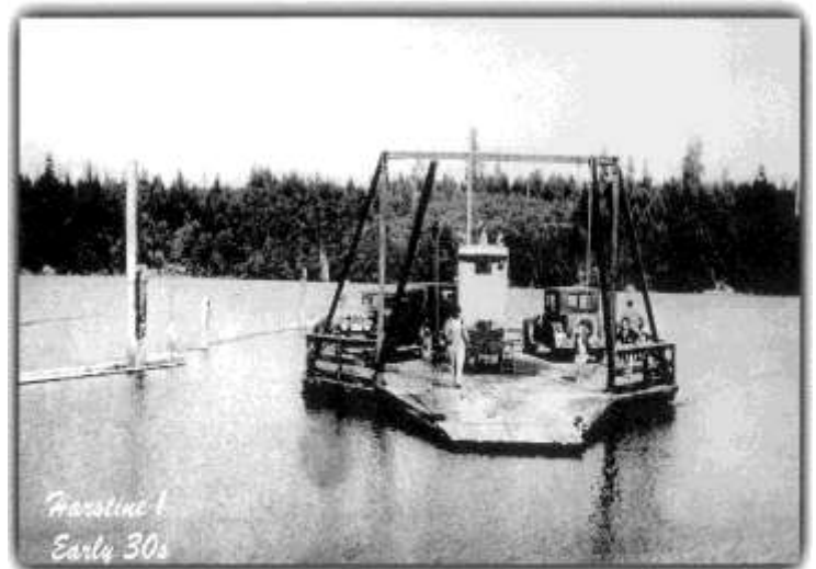
The Harstine Island Ferry in Early 1930s